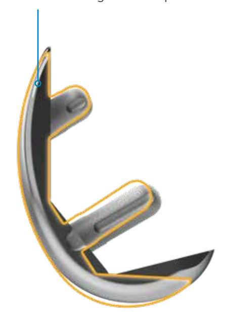
Yellow outline indicates the Zimmer M/G Uni